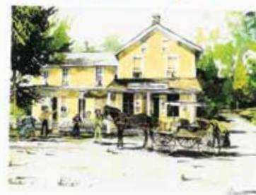
The Ace Store founded 1890